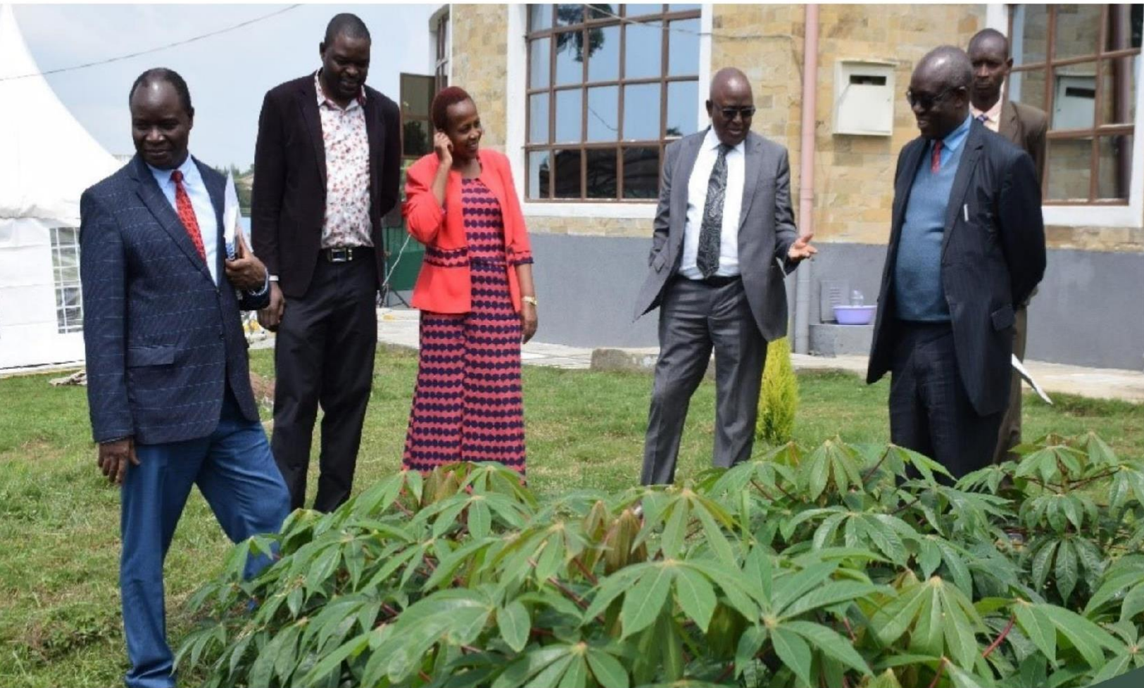
Cassava value chain production is a key focus area for TAGDev program