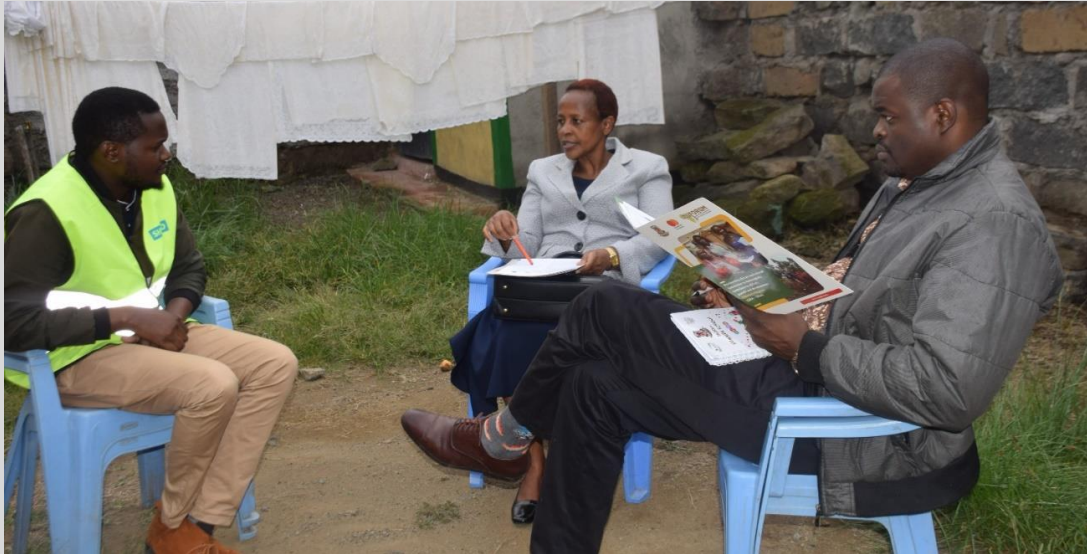
Plate 6: Assessment of students on internship

TAGDev, Egerton University conducted assessment for students on internship in various organizations. The assessment is important in ensuring that students are gaining the requisite skills to prepare them for the job market. It also gives an opportunity to engage with their organizational supervisors to receive feedback on the students' progress.