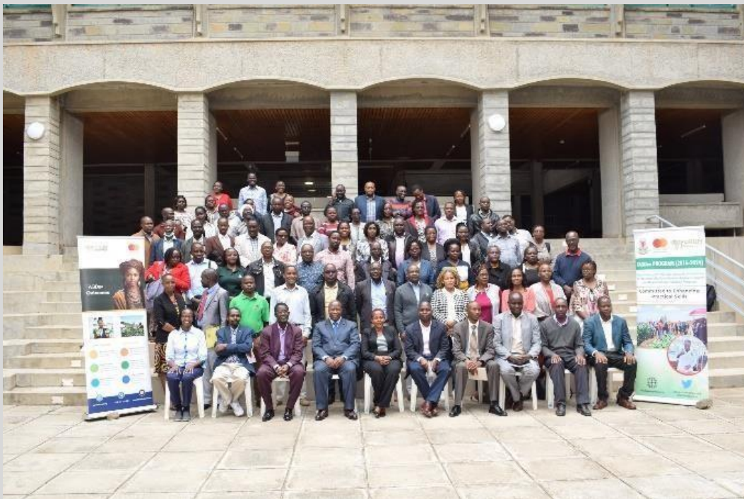
Plate 5: The team of supervisors equipped with supervision skills throughout the three days training.