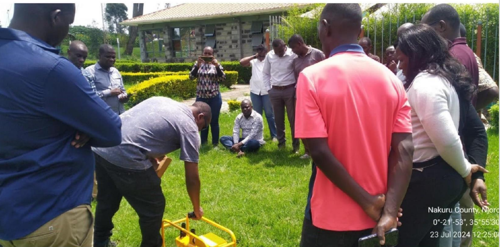
Field demonstrations during the solar and drip irrigation training held at Egerton University