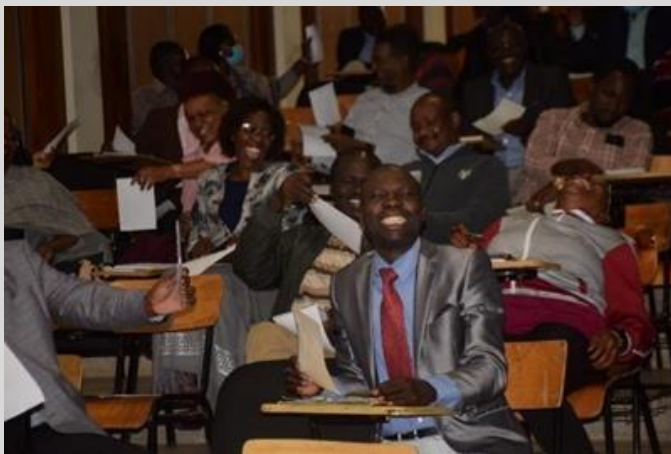
Plate 4: the team of supervisors having a light moment during the Supervisors training organized by Graduate School

The supervisors' workshop was a success due to the huge attendance that exceeded the target of One Hundred and Five (105) participants. Day one recorded One Hundred and Fifty (150), day Two, One Hundred and Thirty-Four (134) and day three, One Hundred and Five (105). An average of One Hundred and Thirty (130) participants per day. The supervisors' participation and presence in the workshop for the three days was enormous.