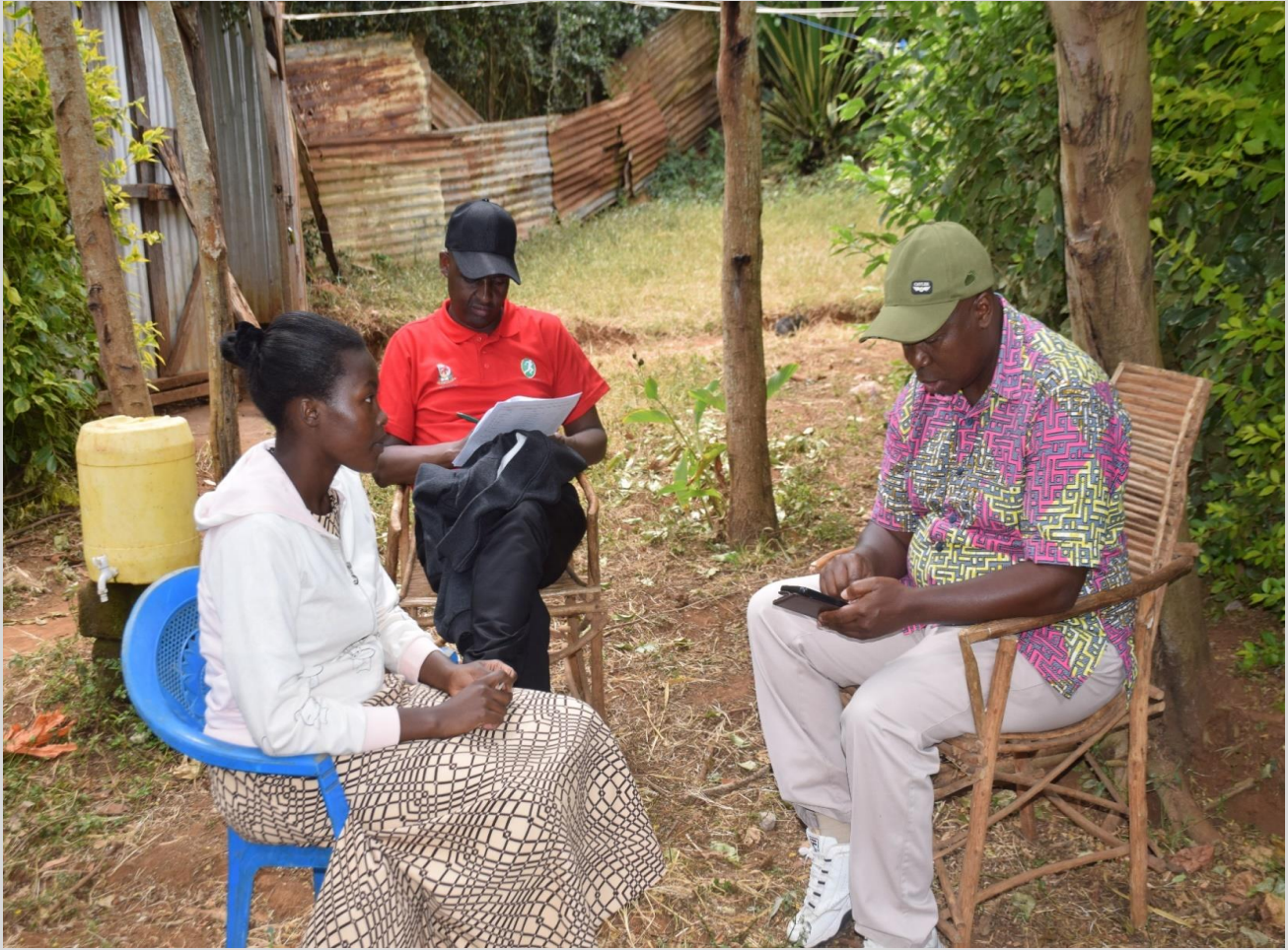
Plate 9: Home validation of TAGDev 2.0 scholars