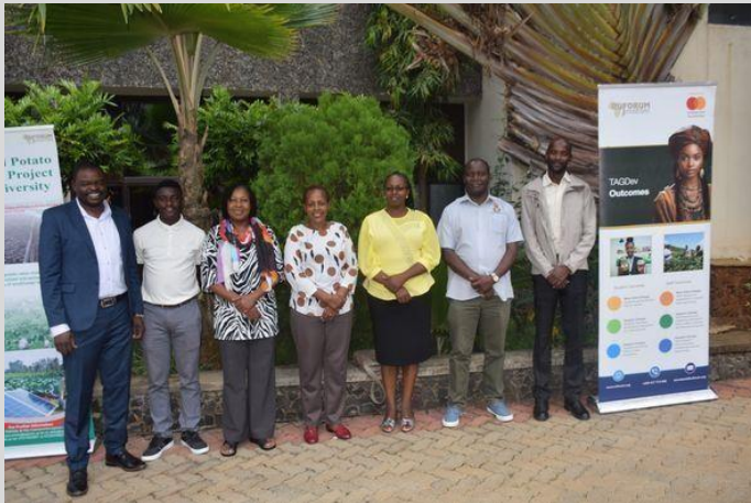
Plate 2: TAGDev team @Egerton University in Kisumu for the end of program Writeshop

TAGDev program held the end-of-Program writeshop for TAGDev 1.0 at the Grand Royal City Hotel Kisumu on July 7th –9th, 2024. This writeshop brought together the program coordinator, assistant, program coordinator, Cassava CARP+ PI, and the secretariat was important in documenting the achievements, challenges faced in the 1st phase of the program's implementation, and future areas of improvement towards the transition to TAGDev 2.0. The members reviewed the Egerton Incubation Framework, policy briefs, the Agri-Food System Community Action Research and Entrepreneurship Program (ASEC) from different partners, narrative reports and annexes. It was noted that there was a need to track the program activities and develop reports for documentation of Program impact.