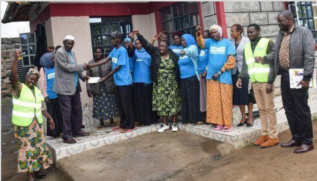
Plate 7: Our students on internship engaging with the community