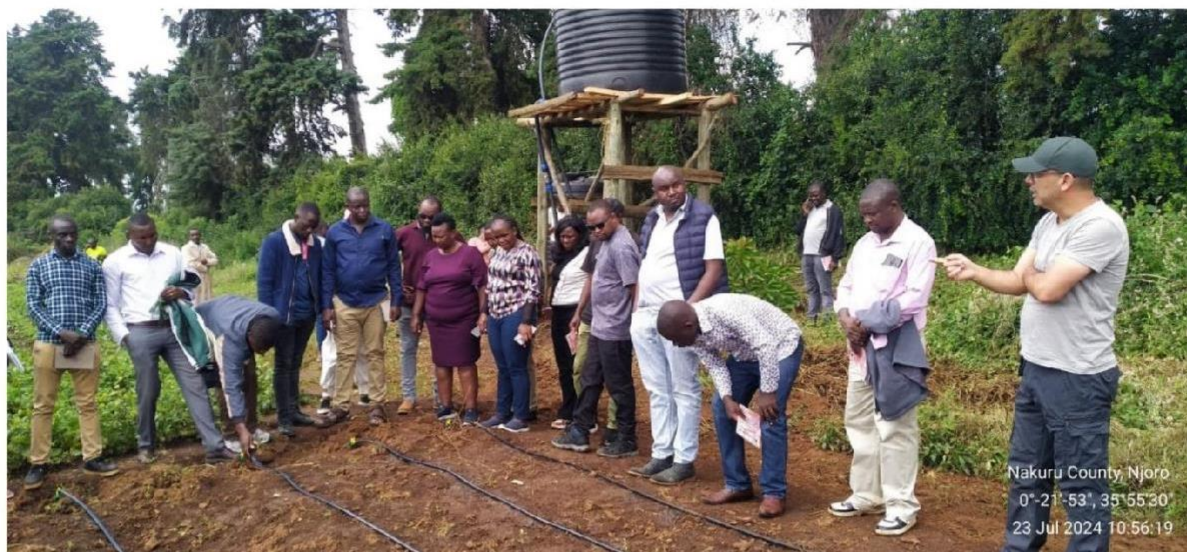
Water drips installation at field 7